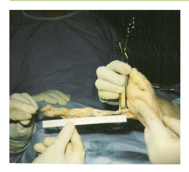
Figure 3 Intraoperative measurement of schwannomaremoved from the plantar left foot. The Schwannoma measures 8cm (with adjacent stump total length 12cm).

A year later she returned complaining of an increase in the size of the left foot. She explained that her symptoms had never completely resolved and she noticed that her left foot was getting larger and more painful in her shoes which also were not fitting properly. An MRI was obtained which identified a large cystic lesion beneath the metatarsals extending from the cuboid to the metatarsophalangeal joints. (Figs. 1 A - F) The lesion measured 8.0cm length, 2.8cm in depth and 3.1cm in width. The lesion coursed distally between the first and second metatarsals. Following the MRI the patient was scheduled for surgical removal of the mass in her left foot. (Figs.2 and 3) Initial histological report suggested neurofibromatosis but further analysis determined the lesion was a schwannoma with no evidence of sarcomatous transformation. The patient's swelling was resolved within several weeks but she continued to complain of numbness between the first and second metatarsals. This was an ongoing complaint up to 5 months post-operatively. At that time she was told that she may have some permanent numbness, which is not uncommon for a lesion of this size and in this area.